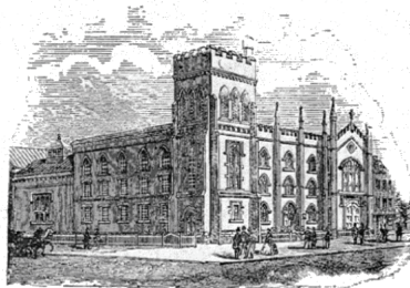
First Odd Fellows Hall in America, Gay Street, 1831.

Grand Lodge of Maryland Independent Order of Odd Fellows Inc.